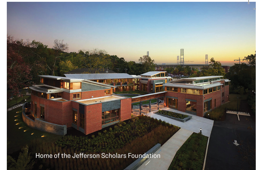
Home of the Jefferson Scholars Foundation

Candidates for the Walentas Scholarship must be nominated by their high schools by December 1. Once nominated, successful candidates will undergo a series of interviews in front of Foundation-appointed selection committees.