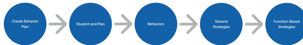
Create Behavior Plan

Behavior Plan is updated to be more comprehensive, while also allowing district administrators to add important fields required for their given state.